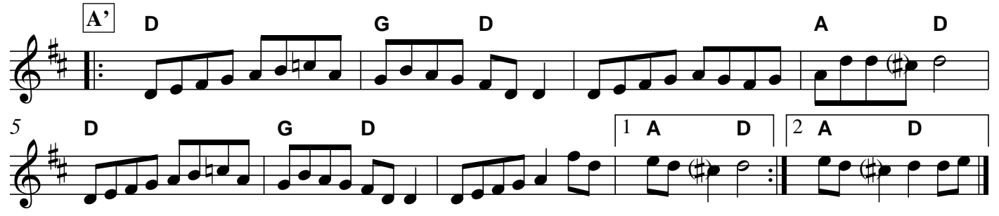
Arranged and typeset in ABC Plus by Pete Showman. Rev. 1: 7/18/2016.

Hammons played measures 3 and 4 differently from what's shown above, and plays 7 and 8 differently from 3 and 4. His 'A' part is roughly like this: